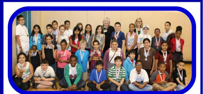
Anthony Carnevale Elem School 2013 Fourth Grade NECAP Medal Winners