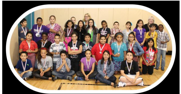
Anthony Carnevale Elem School 2013 Fifth Grade NECAP Medal Winners