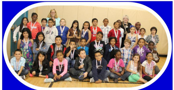
Anthony Carnevale Elem School 2013 Third Grade NECAP Medal Winners